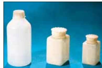
V 953 - V 958/S