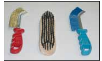
DV 229/3 - DV 229/4 - DV 229/6