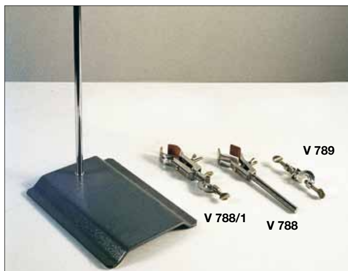
V 786 with V 787