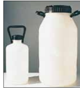
V 975 - V 979