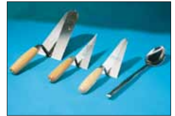
DV 676-DV 680-DV 681-DV 671