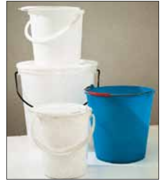
V 970/A - V 973