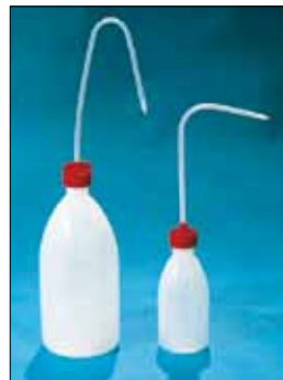
V 710 - V 713