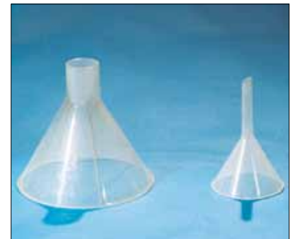
V 968/2 - V 968/C