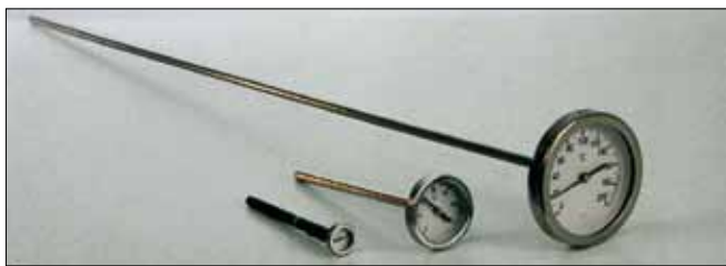
DB 237 DB 237/B