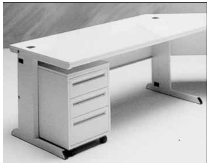
DV 809 - DV 809/C