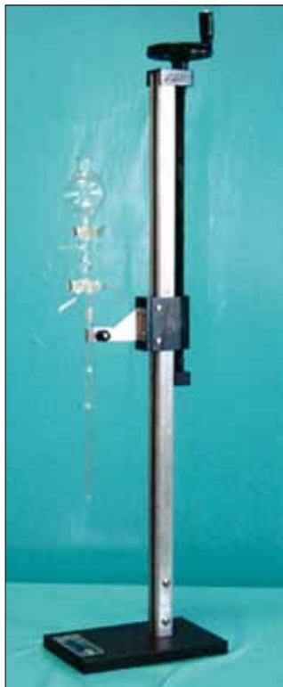
V 779 + V 779/1