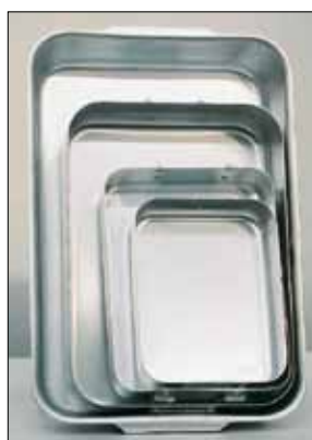
DV 227/1... /7