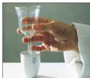
V 987 - V 988