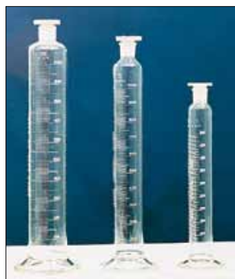
V 701... V 707