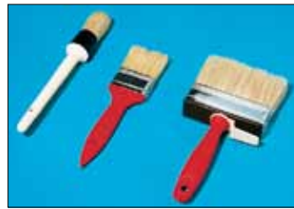
DV 229/9 - DV 229/8 - DV 229/7