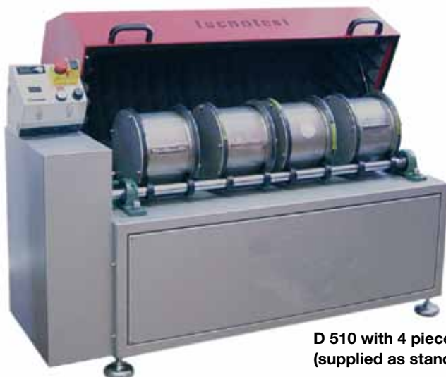
D 510 with 4 pieces D 508/C (supplied as standard)

D 508/G Cylinder dia: 200 x 400 mm (EN 1097/1)