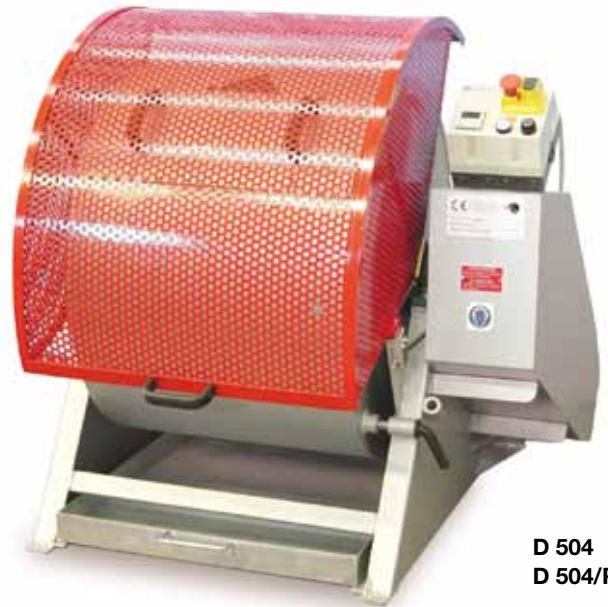
D 504 D 504/PP