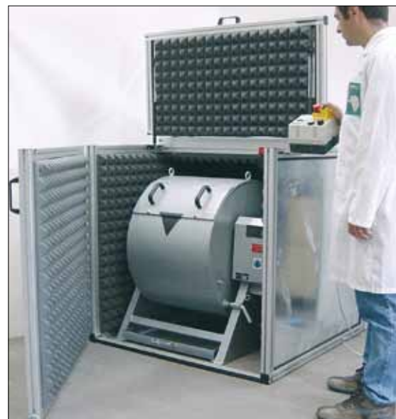
D 504 D 504/P