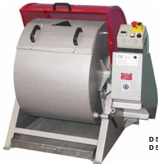
D 504 D 504/PP

N.B.: D 504/P AND D 504/PP HAVE TO BE ORDERED TOGETHER WITH THE MACHINE.