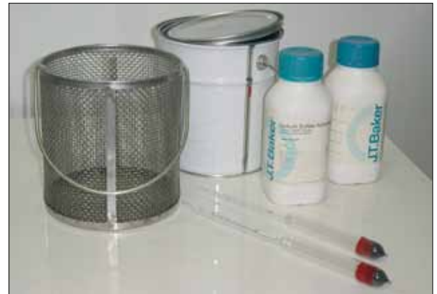
T 620/3 - T 626/4 - T 626/5 - Z 65 - Z 71 - DV 790/4

DV 790/4 Sample tin with cover 5 litres - ø 180 x 220 mm