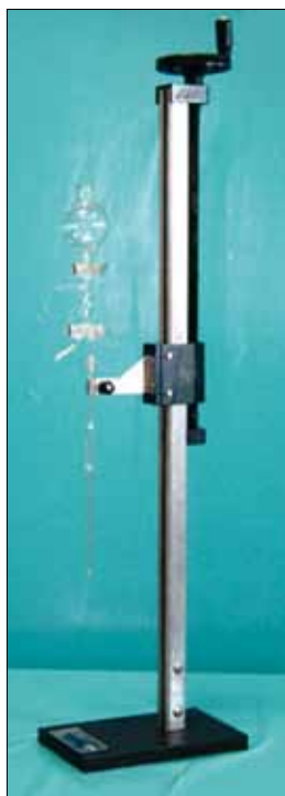
V 779 + V 779/1