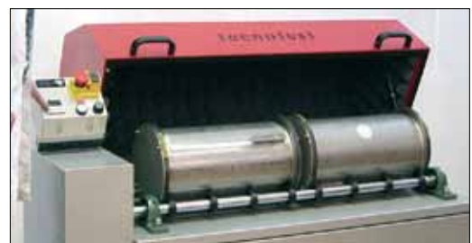
D 510 with 2 pieces D 508/G