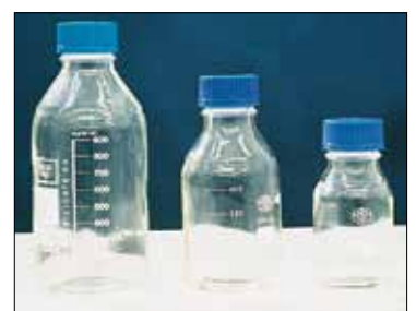
V 759 V 761 V 760