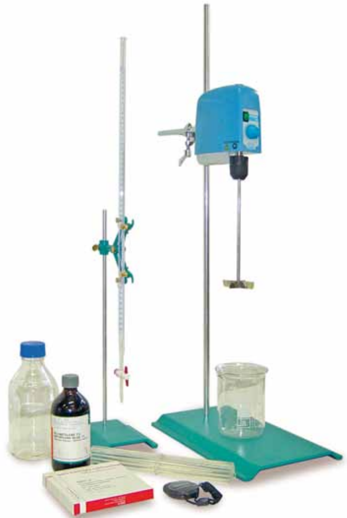
D 657 - V 766 - V 772/3 - V 775/P B 570/1 - V 730 - Z 98 - V 759 - DB 501/D

See page 366 section 5.3.2 for jars and balls